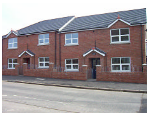
Pictured above are the bungalows on Geoffrey Street and the flats on Tennent Street